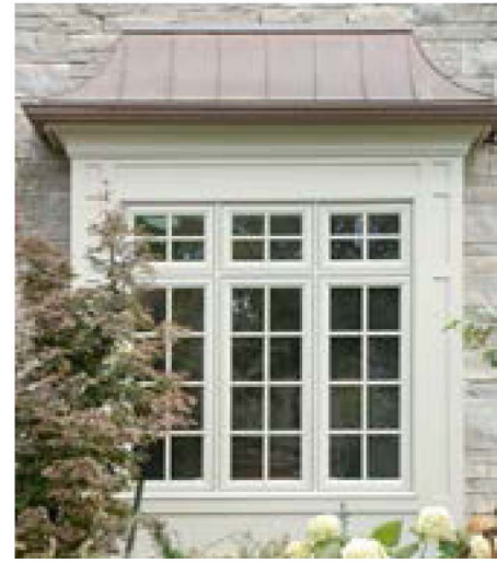
Simulated Divided Lites (S.D.L.)