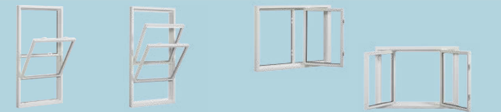
All VinyGuard's Vinyl Extrusions are made of 100% Lead Free Unplasticized Polyvinyl Chloride (uPVC)